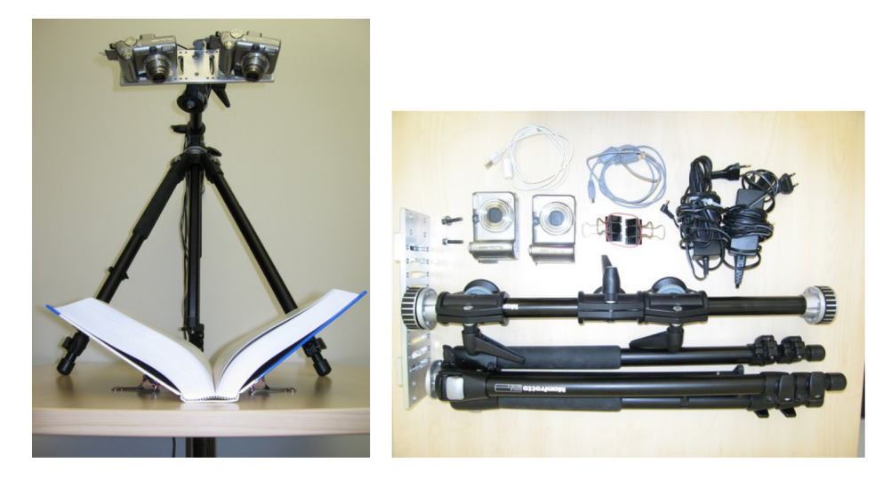
Figure 1. A prototype scanning rig, consisting of standard tripod hardware and consumer digital cameras. The rig is portable and can be operated anywhere using a laptop computer.

resolution digital cameras. The project will deliver an out-ofthe-box solution that allows local staff with modest training to easily capture their material and convert it to archive quality content suitable for deposition in online archives. The solution will deal with bound material that must be treated gently (and also, of course, single sheet material), and will trim the image down to the page boundaries and remove discolorations and other visual defects so as to deliver page images comparable to those from a flat bed scanner. Our proposed solution will accomplish the following: